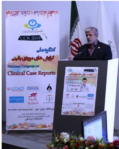
Figure 2. Vice Chancellor for Research and President of the Congress.