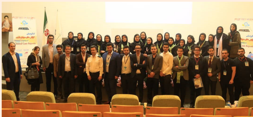
Figure 2. The Organizing Committee of the 2 nd National Congress on Clinical Case Reports of Iran (CCR 2018)