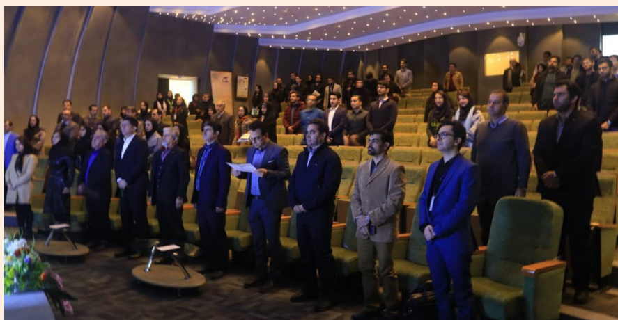
Figure 3. The Opening Ceremony of the Congress.