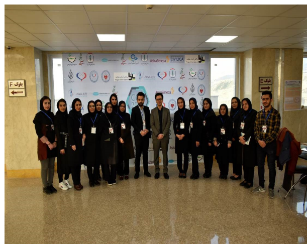
Figure 4. The Organizing Committee of the congress, CCR3 2019.

of Medicine, Alborz University of Medical Sciences, Iran) (Figure 2). In the current conference, over 1000 researchers from different parts of Iran came together to present the latest advances and transformative discoveries in the medical sciences (Figure 3). Highlights of this meeting included plenary lectures from top national scientists and the recognition of the reports of leading and junior scientists with some top awards such as the Clinical Research Development Unit (CRDU) award for excellence in case reports, the young presenter award, etc.