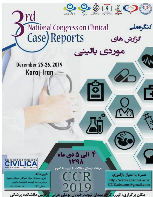
Figure 1. Poster Announcing the 3rd National Congress on Clinical Case Reports, Iran.