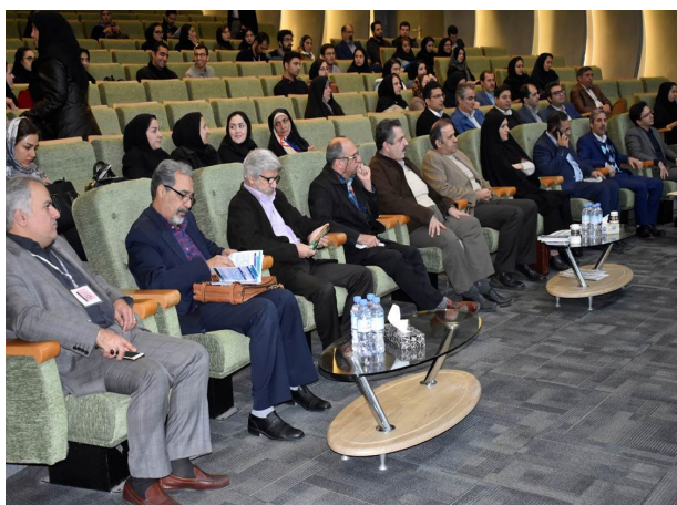
Figure 3. The Participants of the congress, CCR3 2019.