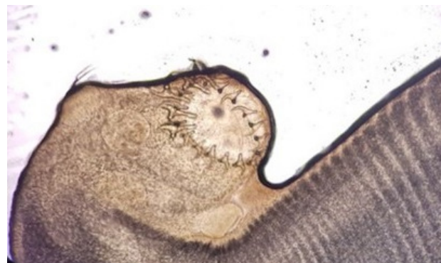
Figure 2. Scolex of Taenia Taeniaeformis with Rows of Hooks.