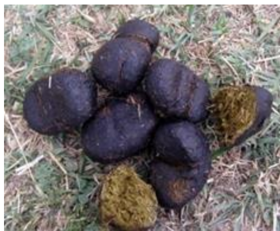
Figure 1. Fresh Donkey Dung Specimens Used in the Present Study.

diffusion test protocol. 14 Fresh donkey dung specimens (Figure 1) were collected from just parturient donkeys in villages around Isfahan in the spring, 2017 and deposited in aluminum foils in order to sterile at 121°C for 15 minutes in autoclave. Then the dung was disintegrated and 100 g of it was placed in a lab balloon and heated at 100°C on an electrical heater. A heat stable plastic tube was attached to the balloon nozzle and the other side of it was placed in the shacked cooled n-hexane solvent (65%). An air flow was entered into the balloon every 5 minutes for better smoke production. The schematic view of the apparatus is shown in Figure 2. Next, the smokes were dried by rotary (Figure 3) and the concentrations of 0.25, 0.5, and 1 mg/mL of them were prepared in dimethyl sulfoxide 99.9%. 15