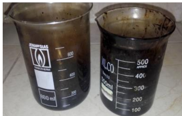
Figure 3. The Donkey Dung Smokes Prepared in the Present Study.