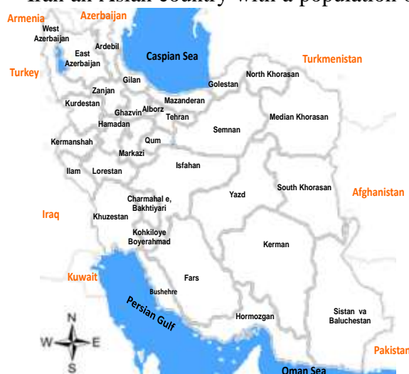
Fig. 1. It shows geographical status of Iran provinces.

Iran an Asian country with a population of