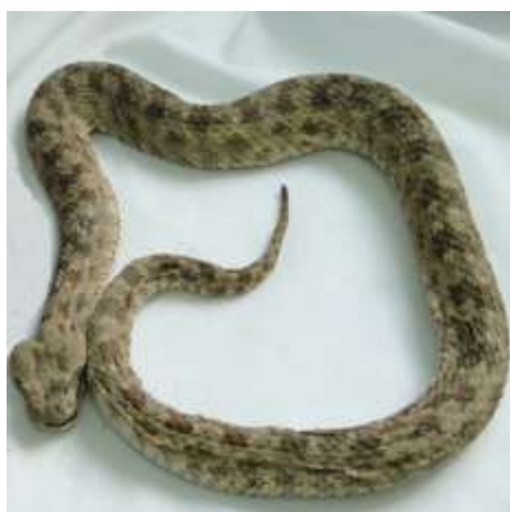
Fig. 5. Pseudocerastes persicus .