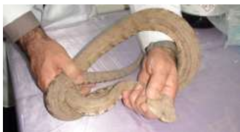
Fig. 3. Vipera lebetina . Personal picture collection of the first author (R. Dehghani).