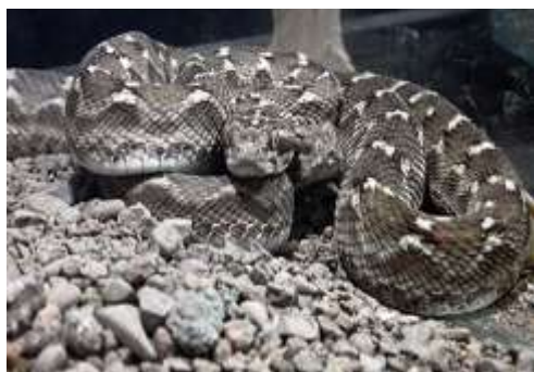
Fig. 4. It shows Echis carinatus .