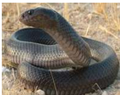
Fig. 6. It shows Walterinnesia aegyptia .

Totally 15373 antivenom vials were used,