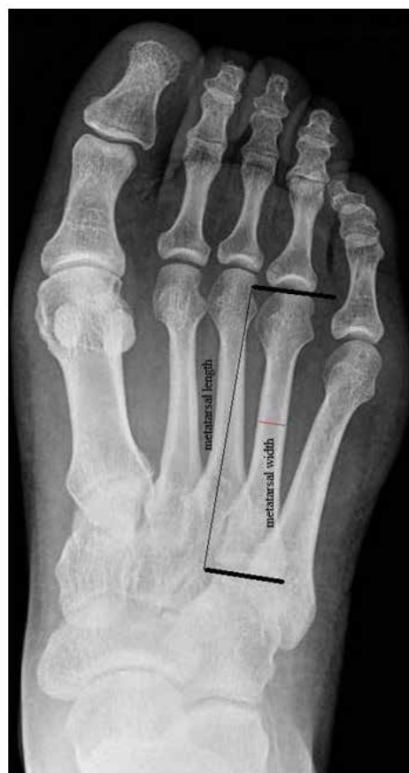
International Journal of Medical Toxicology & Forensic Medicine

According to our study, mean length, width, and L×W indexes in men were larger than those in women. The