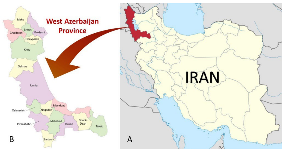
International Journal of Medical Toxicology & Forensic Medicine