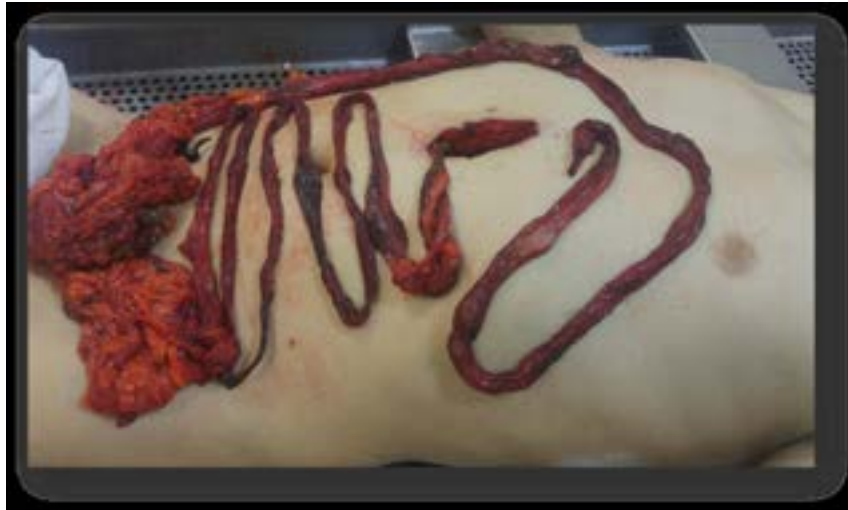
Figure 1. The general appearance of the victim

International Journal of Medical Toxicology & Forensic Medicine