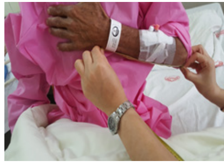
Figure 1. Ulna bone length measurement to calculate height in a patient

Rapid Assessment of Physical Activity (RAPA) questionnaire [31] was used to assess the level of physical activity of the subjects (on average, during one year before the sedentary life due to the complications of disease), and the samples were asked by a questionnaire about doing professional sport. The reliability and validity of RAPA had been previously examined by Khajavi and Khanmohammadi in 2015 [32]. The RAPA questionnaire consists of two parts: (a) the aerobic activities; and (b) the strength and flexibility. According to the scores of the questionnaire, the physical activities of individuals in