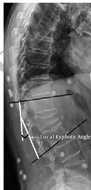
Figure 1. Measurement of local kyphosis, using the Cobb method between superior and inferior vertebrae of the affected vertebra

radiograph, bone mineral density (BMD), magnetic resonance imaging (MRI), computed tomography (CT) scanning, and test of blood 25 (OH) vitamin D level were performed on all patients in the beginning of the study as well. Baseline local kyphosis angle (LKA) was measured using the Cobb method between superior and inferior vertebra of affected level on standing lateral radiograph of affected vertebra (Figure 1). OVCF was classified as: superior endplate, inferior endplate, and anterior cortical wall fracture (Figure 2).