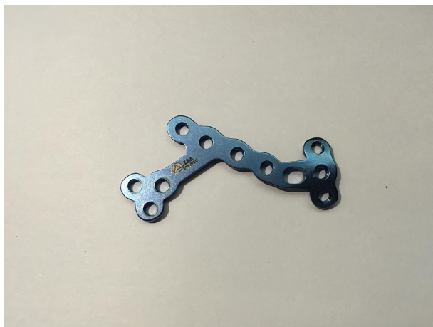
Figure 1. 2.7-mm locking Bijan calcaneal plate

cal Bijan calcaneal titanium plate, regist No.88829; Figure 1), and we applied this plate for this sinus tarsal approach (Figure 2). This new plate is anatomical with a thickness of 1.8 mm, 11 holes (10 locking 2.7-mm screws and one compression screw), and three limbs for fixation of the three main fragments. For the posterior part of the plate, we performed percutaneous screw fixation. With this anatomical low-profile plate, minimal invasive approach can be used for all calcaneal fractures (more in sanders II and III).