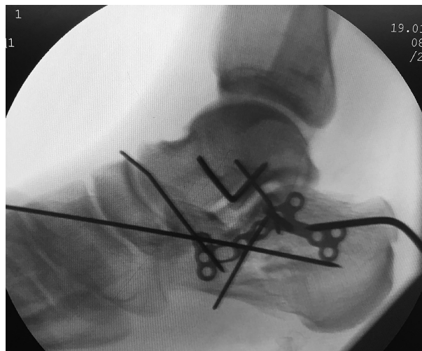
Figure 3. Intra-operative view of Bijan calcaneal plate in sanders III that helped with the fixation of the three main fragments with the minimally invasive approach