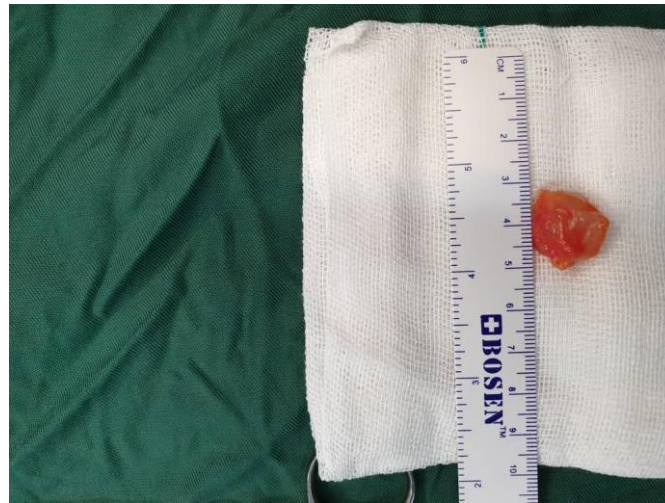
Figure 4. Dissection and resection of the ganglion

Journal of Research in Orthopedic Science