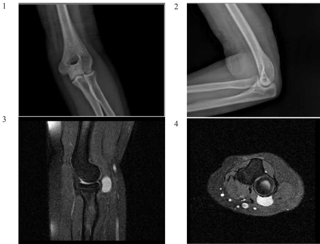
Figure 1. x-ray 1. AP; 2. Lateral; and MRI 3. Sagittal T2 weighted; 4. Axial T2 weighted of elbow

The cyst was on the capsule of the radiocapitellar joint and posterior to the interosseous nerve at the proximal fibers edge of the supinator muscle. The nerve was intact