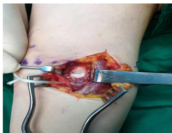
Figure 3. A. Intraoperative picture showing the cyst and B. Rent in the capsule of radiocapitellar joint

Journal of Research in Orthopedic Science