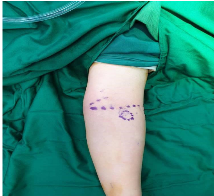
Figure 2. Appearance of the patient's left hand before the operation

Journal of Research in Orthopedic Science