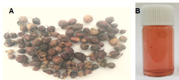
Figure 1. Ribes khorasanicum (A) and its Aqueous Extract (B).

Folin-Ciocalteu Reagent (FCR) test is a general and simple procedure for determination of phenol contents of fruits and medicinal plants. 21 These particular blue pigments have maximum absorption within the range of 700–760 nm, which depends on the qualitative and/or quantitative composition of phenolic mixtures. In brief, 50 µL of extract was mixed with 450 µL of deionized water, 250 µL of Folin-Ciocalteu chemical, and 1.2 mL of sodium bicarbonate (20%, w/v). Afterward, it was put aside at 25°C for 20 minutes, and then centrifuged at 4000