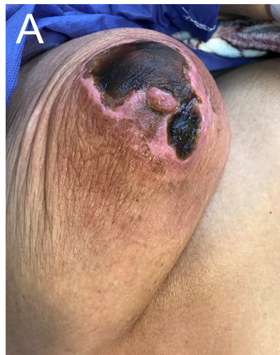
Panel A. Areolar necrotic ulcer with erythematous border

Although we could not confirm the diagnosis by pathologic exam but this mammogram with