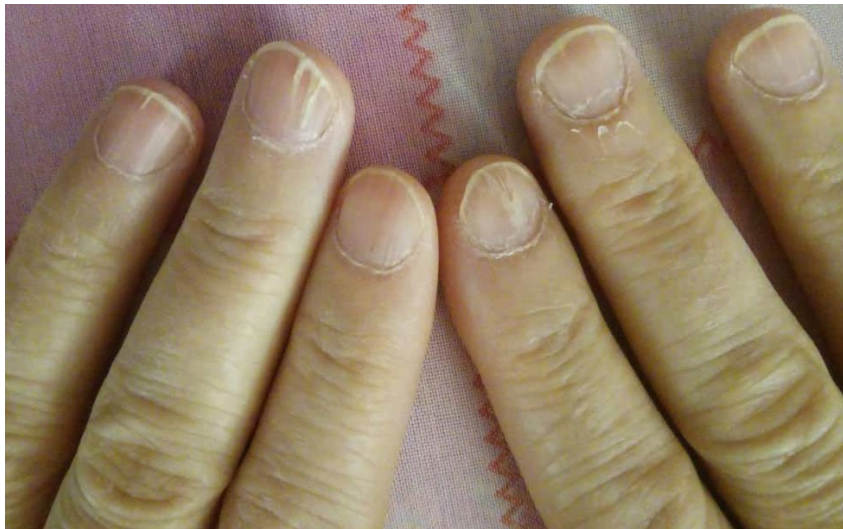
Figure 2. Longitudinal ridges over nails