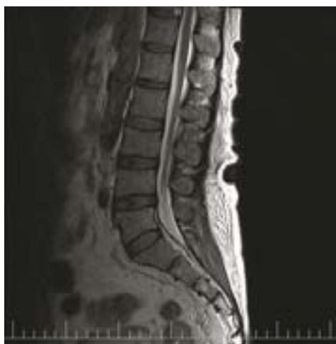
Figure 2. Sagittal section T2-weighted MRI of the lumbosacral spine.

CSF analysis revealed no abnormal findings. Histomorphologic study and IHC staining of spinal cord mass revealed metastatic carcinoma probably from upper gastrointestinal and pancreaticobiliary tract. However, in gastrointestinal studies no finding had been reported related to tumor and malignancy. Eventually, contrary to radiography findings, chest Computed Tomography