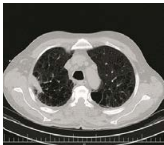
Figure 3. Axial section of spiral chest CT scan (with contrast).

The lumbar vertebral bodies and discs are normal in height and demonstrate normal alignment.