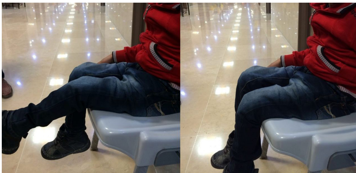
Figure 5. After the knee surgery, the patient's ability to walk and flex the left knee, with 30-degree fixed flexion in extension