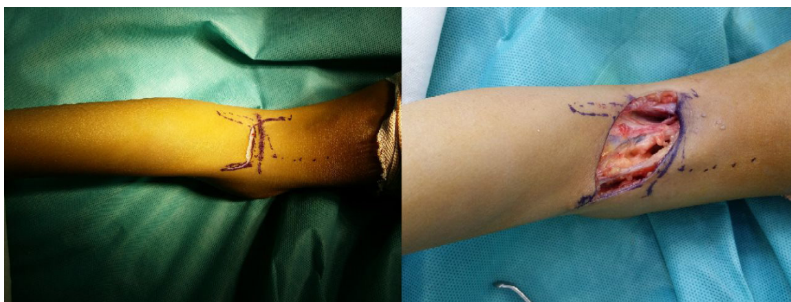
Figure 2. Lazy S-shape incision to expose the posterior aspect of left knee joint

A. Severe flexion contracture of the left knee; B. Abnormal patella height based on the Insall-Salvati ratio seen in lateral knee x-ray studies