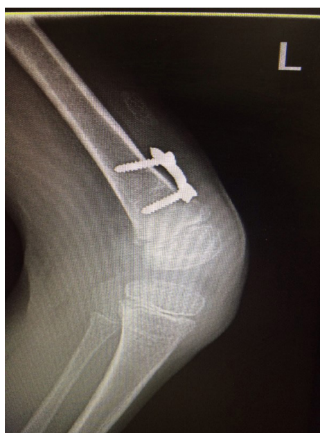
Figure 4. Left knee postoperative radiography

harvested and transferred anteriorly toward the tibial tuberosity. It was secured at the tibial tuberosity by anchor suture and finally attached to the inferior pole of the patella via the patellar tendon, which was detached from the superior capsular part. We were not able to reduce the patella to its normal anatomic position. By the competent quadriceps muscle and patellar tendon, attached now to tibial tubercle via semitendinosus tendon, the patient's extensor function improved considerably. It made the flexion degree residual reduced to 20-30 degrees. Afterward, we performed anterior hemiepiphysiodesis using eight plates in the distal femoral physis. This procedure was intended to correct the residual flexion deformity. In the end, the posterior 3*3 skin defect was grafted with a full-thickness thigh skin