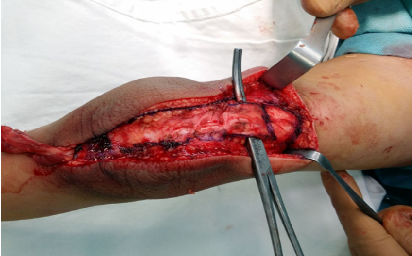
Figure 3. Patella tendon exposed, and the length marked between the inferior poles of the patella to the tibial tuberosity