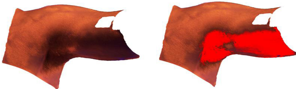
Figure 2. An example of the digital photographs before and after evaluation with the NIS-Element Advanced Research image analysis software. Notably, the region around the axilla remains largely un-prepped with the applicator stick.

An independent evaluator (JB) blinded to the preparation process evaluated the digital photographs to determine areas of un-prepped skin, referred to as regions of interest (ROIs) with the use of the NIS-Elements Advanced Research image-analysis software (Nikon Inc., Melville, NY). The threshold was created to include only a range of colors corresponding to the ROIs. This was done by visual evaluation of areas that did not illuminate under UV-A light. The threshold settings were then applied to all analyzed pictures. The total surface areas of the analyzed surfaces were defined by applying a separate hue threshold that isolated the shoulder from the background [Figure 2].