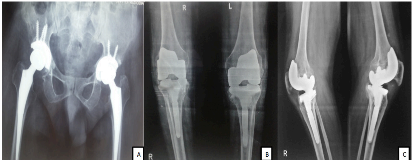
Figure 3. Four years follow up X-ray showing (A) Anteroposterior view of the pelvis with both hips (B) Anteroposterior view of both the knees (C) Lateral view of both the knees.

also operated simultaneously to correct the non-arthritic knee contracture associated with Ankylosing Spondylitis (18). Knee contracture was released by modified posterior soft tissue release (19). So, the concept and need for four joint surgeries was much felt by us for these difficult patients if they present with arthritic knees in addition to hips. The current case was a step ahead of this where the arthritic knees were also replaced simultaneously. Yoshino and Jegersen et al in their independent series of 18 & 16 patients respectively with Rheumatoid Arthritis who underwent replacement of both hips and knees in stages concluded that bilateral replacement of hip and knees can achieve the objectives of relieving pain