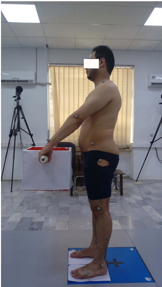
Figure 1. Waist level of box (Used with permission).

boxes that weighed 10% of their body weight. The box dimensions were 34 (width) × 34 (length) × 27 (height) cm. While lifting the box from the ground, the upper limb position was vertical, and the box was placed under the participant's hands [Figure 1]. The subjects stooped and lifted the box by both hands from the ground to the waist level and held it for 20 seconds (19, 20). The examiner emphasized holding the elbows and knees straight during the test. According to this method, the lifting test was divided into two phases of static and dynamic. A motion analysis system (a 6-camera motion capture system, Qualisys AB, Sweden) was used to divide the static and dynamic phases of the test. The system recorded vertical displacement of the marker