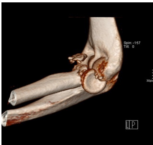
Figure 5. 3-D computed-tomography scan demonstrating a Mason type IV fracture with elbow dislocation and fracture of the coronoid process in a 42-year-old male patient leading to functional instability.

compared to the group of isolated radial head fracture, but without significance [Figure 4]. In the subgroup of patients with Mason IV fracture [Figure 5], the outcomes of group 1 and group 3 were superior to group 2 in terms of secondary osteoarthritis ( P=0.006 ), pain ( P=0.04 ), and functional outcome ( P=0.012 ) [Figure 4].