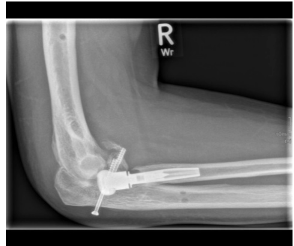
Figure 2. Secondary subluxation of primary inserted radial head resection arthroplasty.

3 patients, signs of superficial infection in 1 patient, and loosening of material in 1 patient [Figure 2].