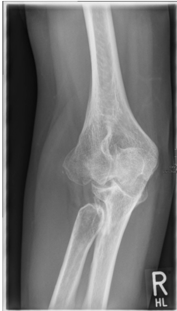
Figure 1. Situation after necessary secondary removal of a primary inserted radial head resection arthroplasty in a 32-year-old female patient.