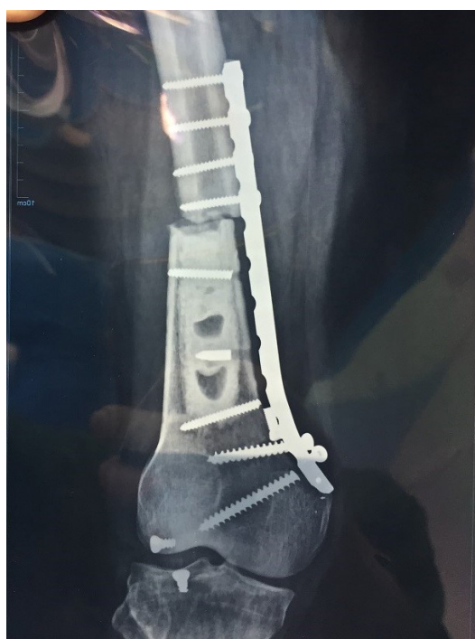
Figure 3. Allograft fixation-device failure.