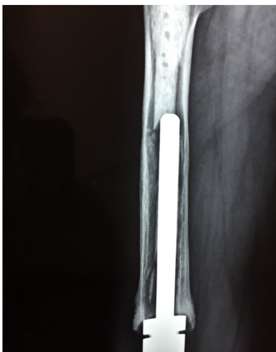
Figure 2. Tumor prosthesis Loosening.

Although the MSTs score in two limb salvaging groups followed a normal distribution pattern, there was no statistically meaningful correlation between the mean MSTs score and the selected reconstruction method [Figure 4; 5].