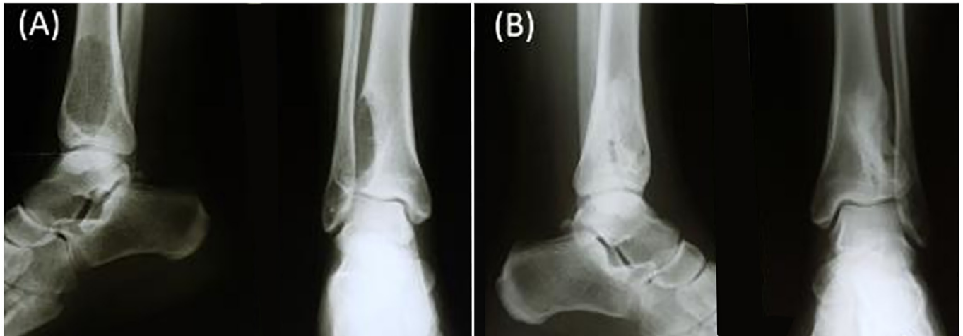
Figure 1. A) Anteroposterior and lateral radiograph of a 25-year-old female with distal tibia giant cell tumor (of bone) B) Two years after extended curettage and bone graft.