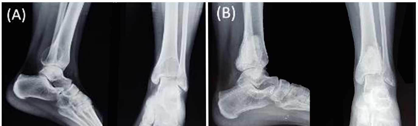
Figure 2. (A) Anteroposterior and lateral radiograph of a 21-year-old female with giant cell tumor of the distal tibia B) Two years after undergoing extended curettage and subchondral bone graft and cementing.

(version 16). The data were descriptively presented as mean±standard deviations or number and percentage. Independent t-test or its non-parametric counterpart (i.e., Mann-Whitney U test) was used for the comparison of the mean differences between the quantitative variables. In addition, the Chi-square test was used for the analysis of the potential association between two qualitative variables. Spearman's correlation coefficient test was also utilized to evaluate potential correlations.