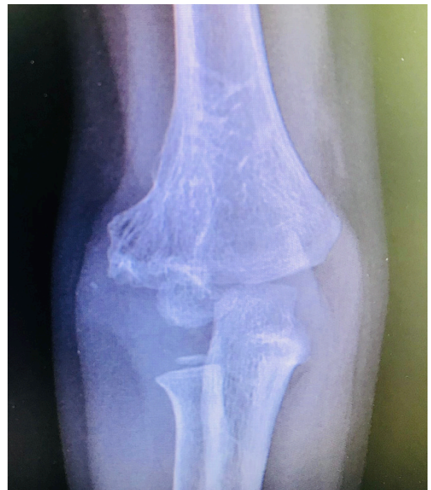
Figure 3. Radiograph showing a lateral spur secondary to a lateral condyle fracture.

Using an anterior approach to the elbow by making a transverse incision was both a feasible and safe technique that allowed for full anatomical reduction of the fractured cartilage in all cases. It also yielded good functional and