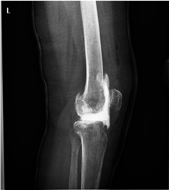
Figure 1. Static cement spacer after performing of anterior and distal femoral cut and proximal tibial cut.

The patient was ambulated with the aid of a walker to bear weight as tolerated.