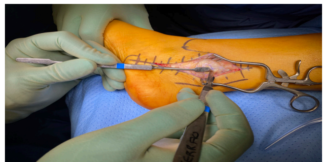
Figure 1. Flexor retinaculum being opened under direct vision.

A medial incision was marked out 1 cm posterior to the medial malleolus extending proximally 10 cm and curving distally approximately 5 cm. The skin incision was made and slowly deepened down to the flexor retinaculum. The flexor retinaculum was then opened under direct vision [Figure 1]. A muscle belly was identified directly under the sheath, which was not expected to be there. The muscle belly, which was found during the dissection, was identified as an FDAL muscle. This muscle was enveloping the posterior tibial nerve. The muscle was carefully released off the posterior tibial nerve [Figure 2]. The muscle belly could easily be transposed posteriorly to the nerve relieving the pressure; consequently, it was not resected [Figure 3]. Neurolysis of the posterior tibial nerve was conducted. The nerve was then dissected distally to where it branched into the medial and lateral plantar nerves. The medial branch was first dissected out distally to where it dived deep to the abductor hallucis muscle. The fascia of the abductor hallucis muscle was released around the nerve. Afterward, the lateral branch was dissected out deep into the sole of the foot. A neurolysis of the first branch of the lateral plantar nerve was also performed. Careful hemostasis was achieved, and the superficial layers of the wound were closed in layers. The leg was placed in a back slab. The patient's MRI was carefully re-evaluated, resulting in the