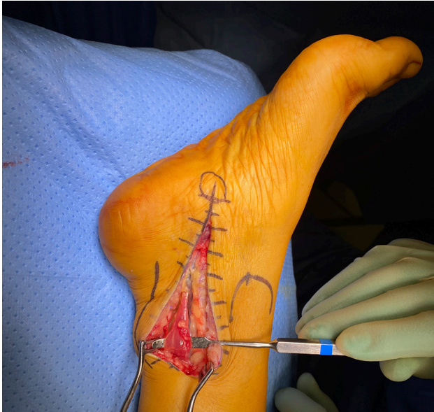
Figure 2. Flexor digitorum accessorius longus muscle being carefully released off the posterior tibial nerve.

include the FDAL, accessory soleus, peroneocalcaneus internus, and tibiocalcaneus internus. Flexor digitorum accessorius longus muscle is predominantly found in