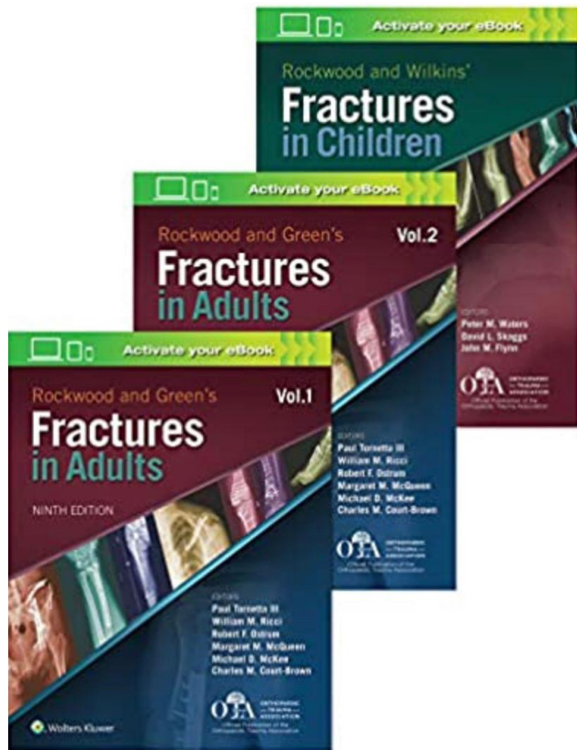
Figure 3. Textbook: Rockwood and Green's Fractures in Adults & Children.