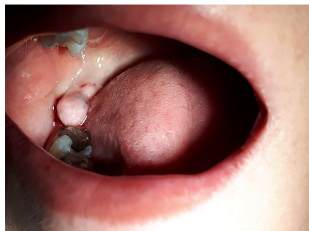
Figure 1. The first case of a 36-year-old woman with fibrolipoma preoperative

intact surface, approximately 1 × 2 cm in dimensions. It was located in the retromolar pad area on the right side of the mandible (Figure 1). Due to the patient being asymptomatic during this period, she had not received treatment. After obtaining consent, the lesion was removed by electrocautery to prevent bleeding and fortunately, significant bleeding did not occur. The sterile compression pack was sufficient and there was no need for suturing.