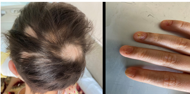
Figure 2. Alopecia areata, nail changes and finger hypopigmented spots.