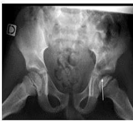
Figure 3. Frog leg radiograph of a boy with perthes disease in the left hip showing "Finger nail hit" sign

According to the Waldenström classification (10), in the early stages of the disease: widening of the medial hip joint space, "finger nail hit" sign (Figure 3), reduction in epiphyseal size with condensation and opacity are seen on radiographs (Figure 4-A).