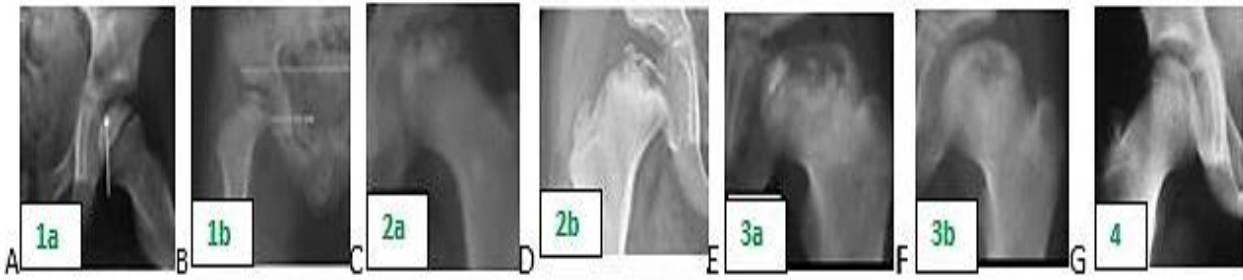
Figure 2. Modified Elizabethtown classification: Perthes disease from initial stage (A and B) to fragmentation (C and D), re-ossification (E and F), and remodeling period (G). Each stage is divided into early (a) and late phase (b).

Age at onset, stage of disease, condition of epiphyseal femoral head and extent of involvement, and the extrusion of the femoral head are the most important criteria considered to determine the prognosis of the disease and outcomes. The disease onset after the age of six, female gender, obesity, and hip joint stiffness, especially limited abduction, are associated with poor results (8,9).