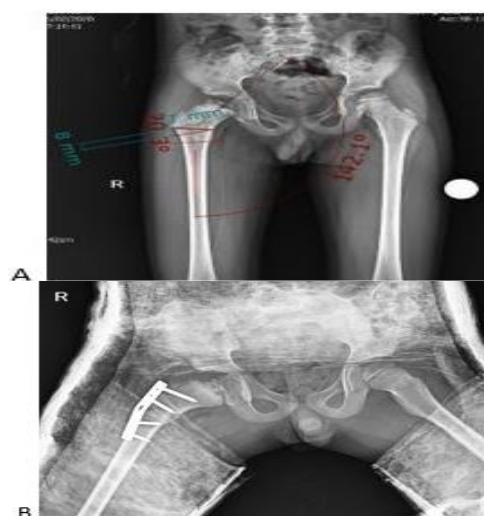
Figure 8. Usually, a 20° varisation is sufficient and should not exceed 110°. In our patient, according to the preoperative calculations made for an open wedge osteotomy technique for 20° of varus, 8 mm should be opened (A). Post-operative result (B)

The authors declare no conflict of interest in this study.