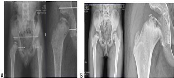
Figure 4. (A) Anteroposterior (AP) radiograph of a 6 year-old boy showing widening of the medial part of the right hip joint space and reduction in epiphysis size, (B) AP radiograph of the same patient 6 months later; the disease is in the fragmentation stage, and the extrusion and involvement of more than 50% of the femoral head are obvious.

Subsequent fragmentation of femoral head epiphysis (which corresponds to its revascularization and replacement by chondroblasts) happens in late stages (Figure 4-B) (11).