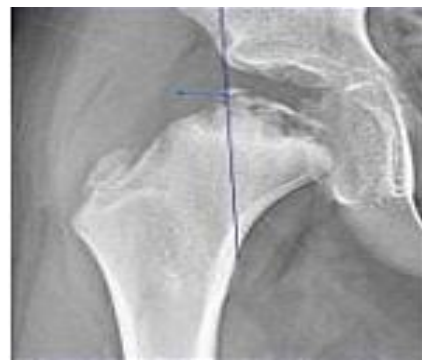
Figure 5. Extrusion of the femoral head laterally by a highly big epiphysis measured from the lateral edge of the acetabulum

An important finding to be considered for further treatment decision-making was the extent of the femoral head extrusion (Figure 5). However, it was better detected on the magnetic resonance imaging (MRI) to see cartilaginous under coverage. Therefore, the use of this modality may expand in the future (12,13).