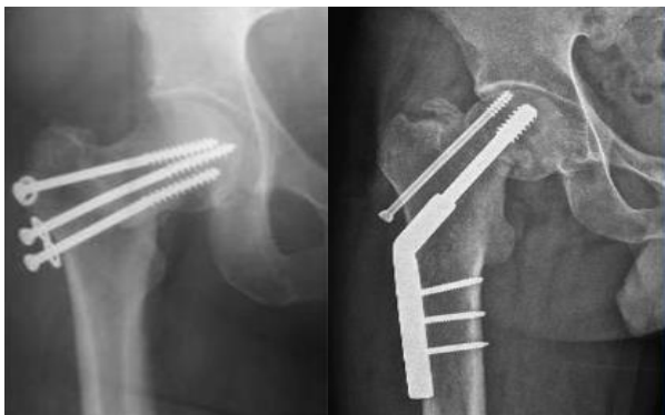
Figure 4. A 45-year-old male patient with failed open reduction internal fixation (ORIF) of the femoral neck (left) who underwent re-osteosynthesis using a dynamic hip screw (right)

As can be seen in figure 4, our 45-year-old male patient with failed ORIF of the femoral neck has been treated with re-osteosynthesis using a dynamic hip screw (DHS). It was because the fracture was with low shearing force, the femoral head was viable, and there was good bone stock.