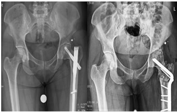
Figure 3. A 33-year-old female patient with left hip pain after eight months following the fixation of a femoral neck fracture (left) who underwent valgus osteotomy (right)

As can be seen in figure 4, our 45-year-old male patient with failed ORIF of the femoral neck has been treated with re-osteosynthesis using a dynamic hip screw (DHS). It was because the fracture was with low shearing force, the femoral head was viable, and there was good bone stock.