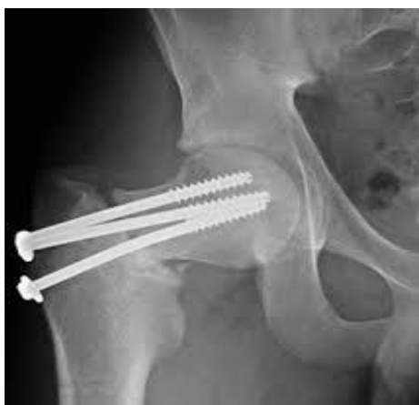
Figure 1. The Right hip anteroposterior (AP) radiograph of a 44-year-old man with femoral neck fracture and right hip pain after six months of fixation in another center.

This study addresses the approach to the failure of a femoral neck fracture fixation construct and is performed with the aim to discuss the causes and treatment options of the failure of a femoral neck fixation construct in a stepwise approach (Figure 1).