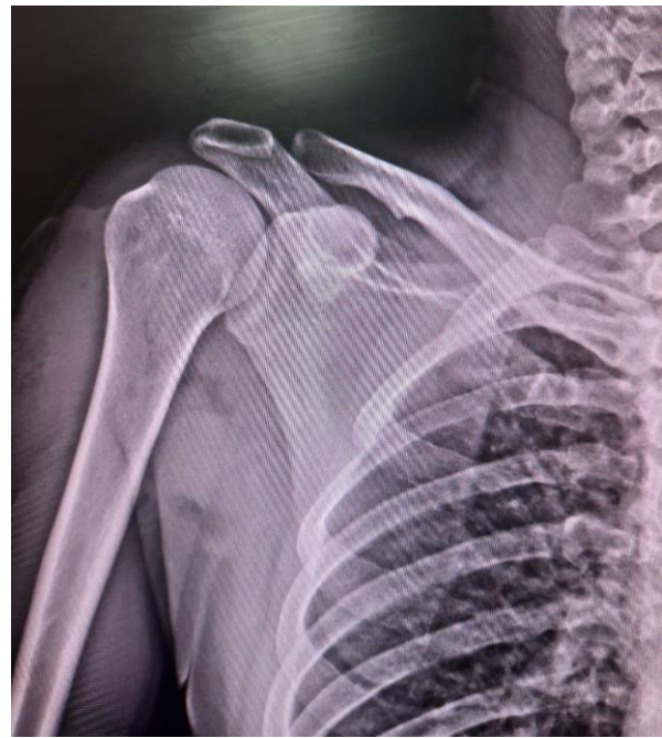
Figure 5. Postoperative radiograph of the right shoulder

The patient was closely observed and serial neurovascular examinations were performed. The wound was re-opened after 24 hours, explored, irrigated, and tightly closed after normal exploration.