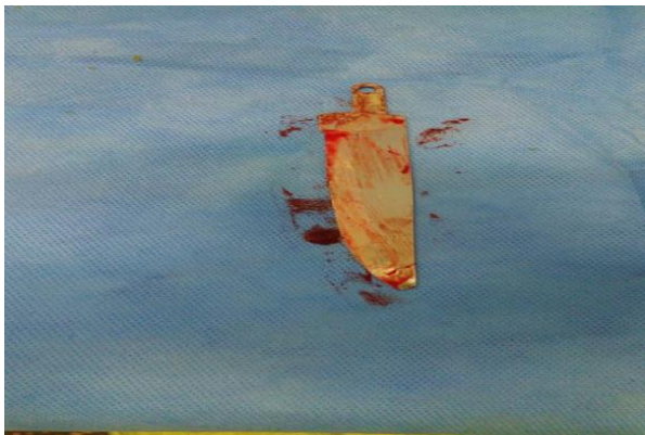
Figure 4. The knife blade after removal from the wound

In a semi-lateral position, the wound was extended superiorly and inferiorly through a posterior approach. No neurovascular injury was detected. Under hemodynamic monitoring, the blade was carefully drawn out without any vigorous movement to prevent neurovascular injuries (Figure 4). Fluoroscopy was used to make sure of any remaining foreign body (Figure 5). The surgical team decided to postpone exploration of the anterior aspect of the scapula for 24 hours. This decision was made based on the dangerous adjacency of the anterior tip of the blade and vulnerability of the brachial plexus on one hand, and an intact physical examination and CT angiography on the other hand. Therefore, after irrigation and debridement, the skin was loosely closed.