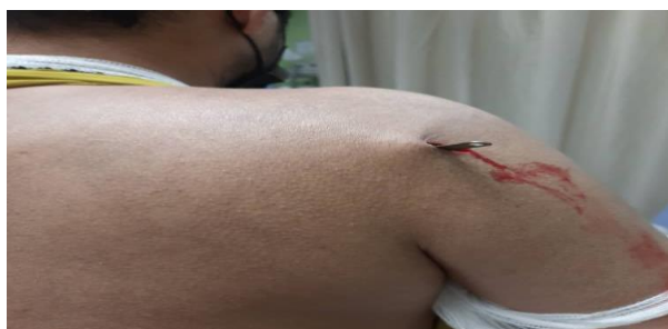
Figure 1. The knife stab wound penetrating from the posterolateral border of the right shoulder

A 32-year-old man came to the emergency department with a stab wound to the right shoulder. A knife blade penetrated from the posterolateral border of the right shoulder, medial to the axillary fold, and stuck in his scapula (Figure 1).