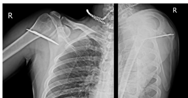
Figure 2. Anteroposterior (AP) and lateral radiographs of the right shoulder

The patient was hemodynamically stable and had no accompanying injuries. Necessary imaging was performed, including anteroposterior (AP) and lateral radiographs of the right shoulder (Figure 2), fine-cut computed tomography (CT) scan of the right shoulder (Figure 3), and CT angiography of the upper limbs.