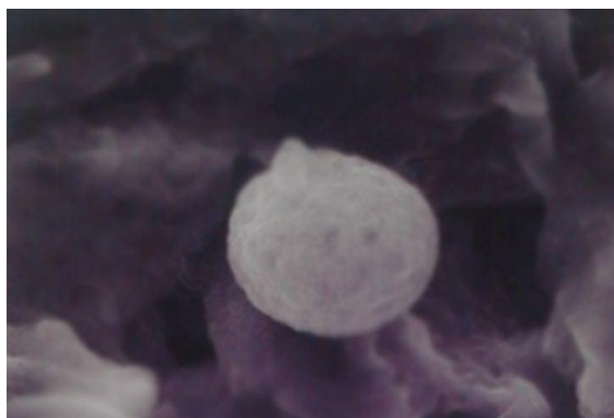
Figure 2 Scanning electron microscope image of carvedilol-loaded floating microspheres

In vitro buoyancy study for carvedilol-loaded floating microspheres was found to be 79.0%. The prepared carvedilol-loaded floating microspheres showed the maximum buoyancy due to the size and polymer concentration of prepared floating microspheres. The %entrapment efficiency of carvedilol-loaded floating