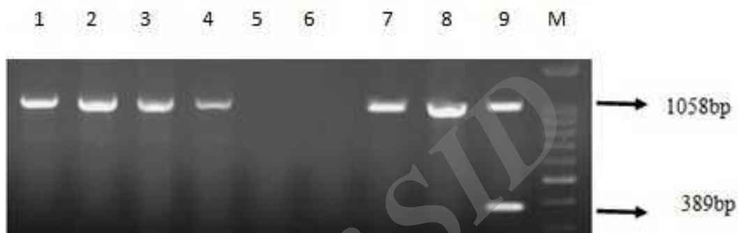
Fig. 3. PCR amplification fragments for the detection of oxa-23 and oxa-48 genes among Acinetobacter baumannii isolates. Lane 1- 4 and 7, 8: positive oxa-23 strains, lanes 5, 6: negative control of oxa-23 and oxa-48 genes, lane 9: positive control of oxa-23 and oxa-48 genes and M: 1kb DNA size marker