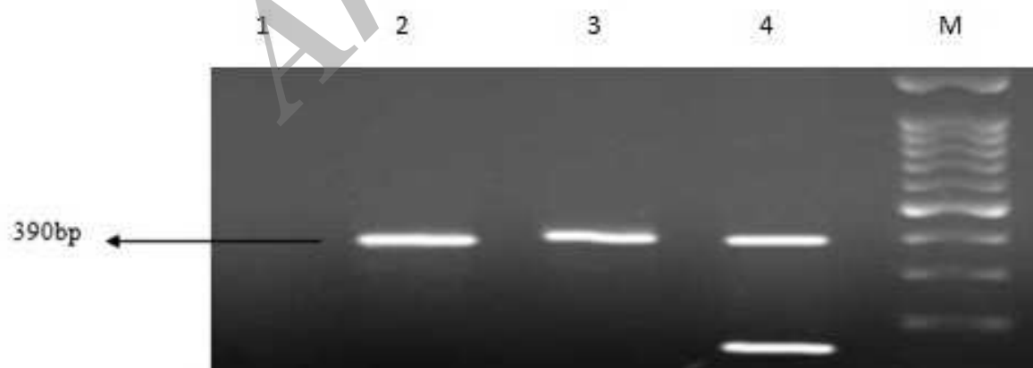
Fig. 1. Multiplex PCR amplification fragments for the detection of vim and imp gene among Acinetobacter baumannii isolates. Lane 1: negative control, lanes 2, 3: positive vim strains, lane 4: positive control of vim and imp genes and M: 1kb DNA size marker

According to many studies, A. baumannii is known as one of the most common Gram negative bacteria that can cause nosocomial infection in health care centers especially in burned hospitalized patients (2, 3, 8). Treatment of infection due to XDR A. baumannii is extremely difficult and causes more morbidity and motility in hospitalized burn