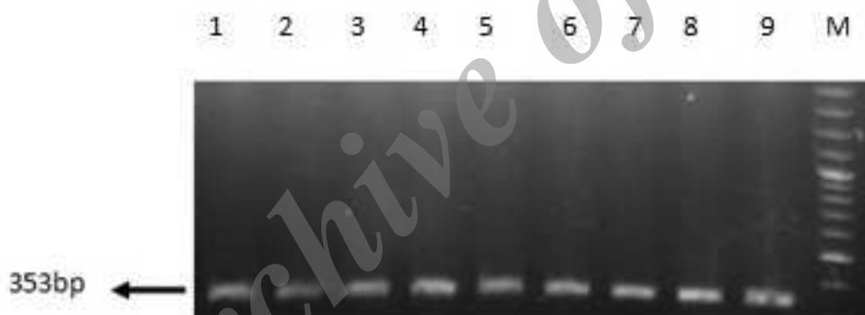
Fig 4. PCR amplification fragments for the detection of oxa-51 gene among Acinetobacter baumannii isolates. Lane 1: positive control of oxa-51 , lanes 2- 9: positive strains of oxa-51 .and M: 1kb DNA size marker

patients (13, 19). The results of this study indicated that 98.4% of A. baumannii were resistant to all tested beta lactam antibiotics and 55% of them remained susceptible just to colistin and tetracycline. Generally, carbapenemases producer strains of A. baumannii convert to XDR strains and can be resistant to most antibiotics used for the treatment of A. baumannii infections. Wounds of burned patients generally infected by multiple bacteria harboring antibiotic resistance genes located in transferable genetic elements, can be a