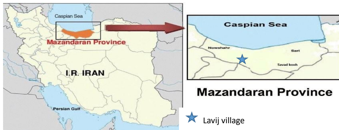
Figure (1): Targeted region: Lavij village in Mazandaran province (Made by the authors on http://www.researchgate.net/ )

The main occupation of the village residents is agriculture, handicrafts and animal husbandry. Among Lavij's physical and cultural attractions rivers, waterfalls, hot and cold spring, forest area and chalets, castles, shrines can be noted ( Kheiri, and Nasihatkon, 2016)