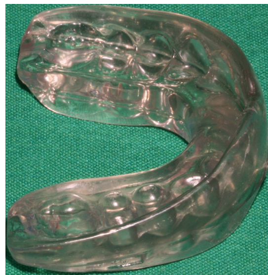
Figure 1. Multi-P Appliance.

This appliance is manufactured in silicone for patient's convenience with its high vestibular