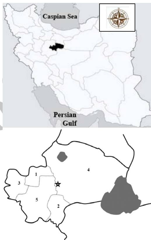
Figure 1) Map of Iran, highlighting the position of Qom Province and its five districts: 1. Jafarabad, 2. Kahak, 3. Khalajestan, 4. Markazi, and 5. Salafchegan (Qom Province)

The annual rainfall was 86.9 mm and relative humidity was ranged between 8.5 in June and 89.1 percent in December.