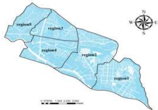
Fig. 1: Tabriz, zone 1

This paper examines the physical vulnerability of both formal and informal residential areas (region 1 and 5) against earthquakes.