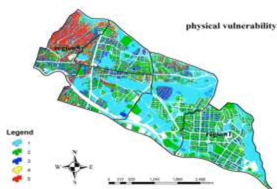
Fig. 2: Map of physical vulnerability areas in Tabriz zone 1

According to field studies, the official and also informal tissues were identified. Based on these observations, the north-west side of the study area (Seylab district) is recognized as informal residential area. This tissue is identified as one of the most crowded areas with high rate of building and population density. In addition, the absence of spatial planning in construction of buildings of this area has made the condition even worse. Otherwise, the planned or official area (Valiasr town) has been placed in the south-east side. The visual obtained result clearly shows the vulnerable areas. As observed, the most risky area in terms of physical vulnerability is where, which was identified as unplanned area (Seylab district). In this case, the mentioned conditions have exposed 30 percent (62300 citizens) of the zone 1 residents in high risk. The obtained results also show the importance of planning before construction of a district. However, the Valiasr region as a planned tissue mostly is in low vulnerability condition.