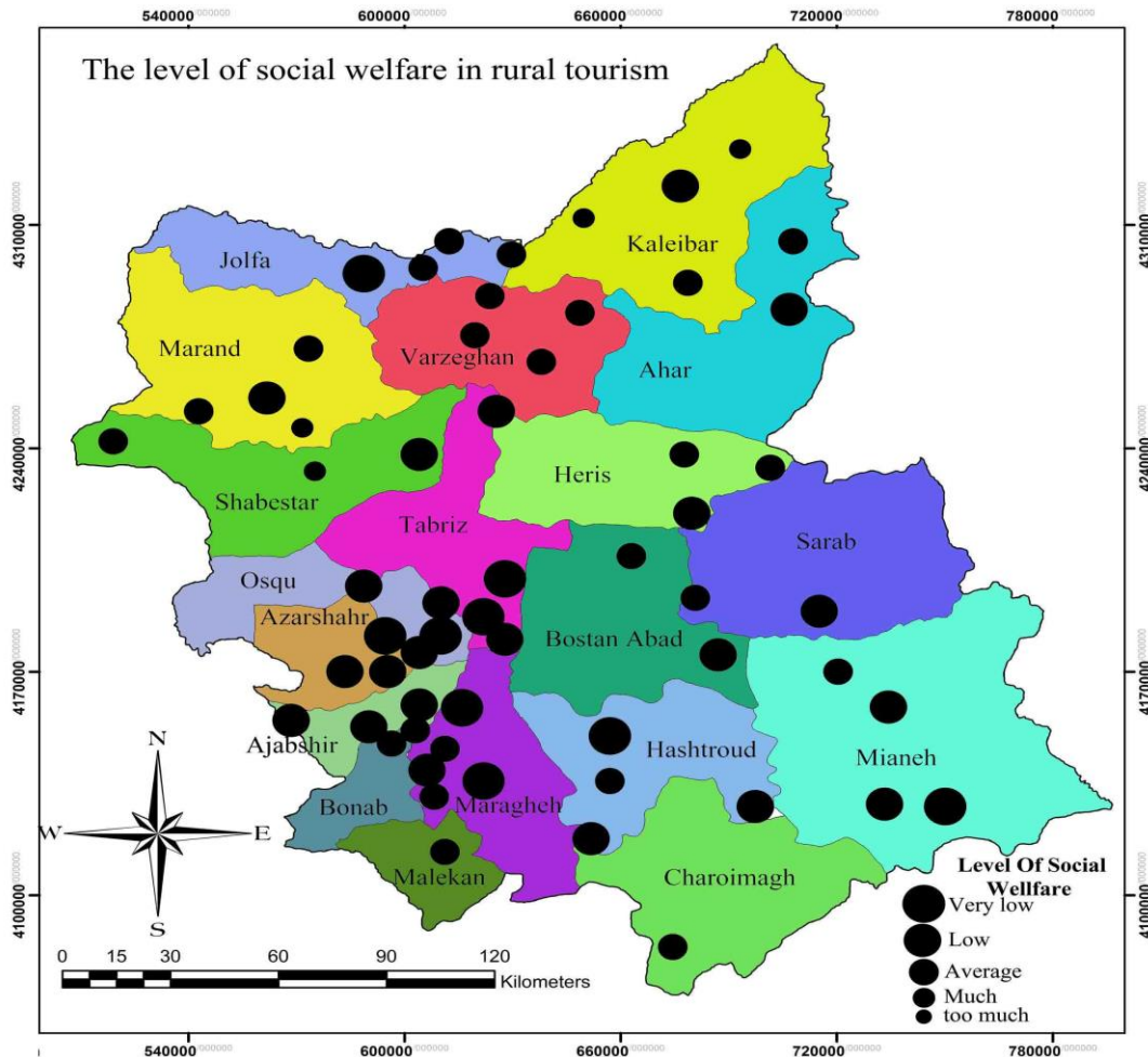
Fig.4. Districts prioritizing rural areas in terms of social welfare

villages of East Azerbaijan province from the viewpoint of five levels of social welfare been drawn. (Fig 4)