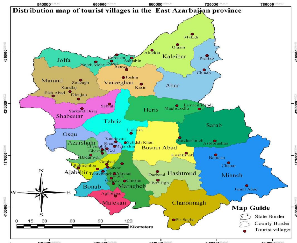
Fig.2. Geographical distribution of tourist villages of East Azerbaijan province

Is there any relationship between rural tourism development and the improvement of rural social empowerment? Is there any relationship between rural tourism development and rural housing quality enhancement? Is there any relationship between rural tourism development and the increase of future expectancy? Is there any relation between rural tourism development and the increase of technical and professional skills?