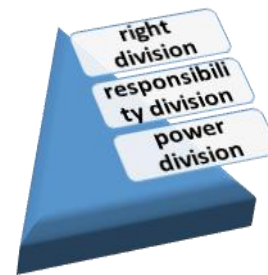
Figure 1. Gender Analysis Pyramid

Gender analysis addresses questions such as who does what; who owns what; who decides; who benefits from the result of the decisions, and who is a loser. Gender analysis addresses the division way of power, responsibility, and right (Norwegian Development Cooperation Representative, 1999).