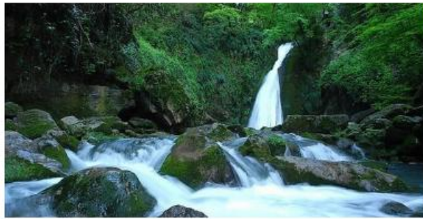
Figure 12. Beautiful Waterfalls in Shir-Abad, Golestan Province, Iran