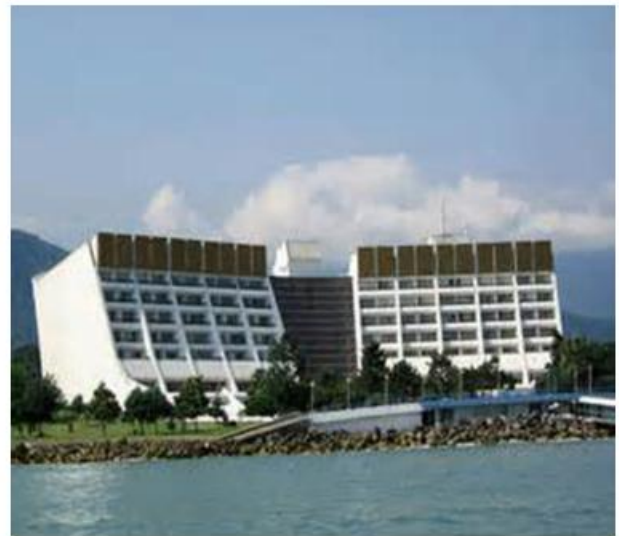
Figure 14. Azadi Hotel Overlooking and Bordering the Caspian Sea ( http://www.southtravels.com/middleeast/iran/caspianazadi/index.html )

The northern provinces also have fine museums, parks, restaurants, and striking architectural landmarks and monuments (Figure 17). The city of Masuleh has a unique architecture and is surrounded by forests from valleys to peaks. Masuleh is a city in the Sarda-r-e Jangal District of Fuman County, Gilan, Iran. Masuleh is approximately 60 km southwest of Rasht and 32 km west of Fuman (Figure 18).