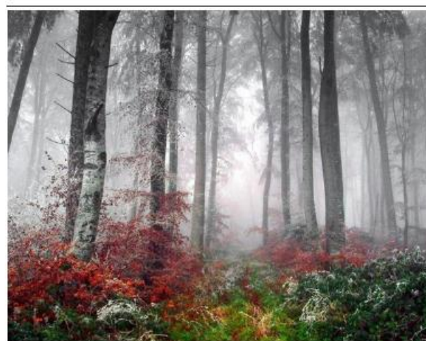
Figure 1. Dense Misty Forest With a Calm, Peaceful and Serenic Atmosphere - Perfect for Hiking

Back to nature: The Gilan and Mazandaran, provinces have beautiful dense forests and national parks that are ideal for camping, hiking and biking; the beauty and solitude is euphoric (Figures 1-4).