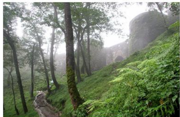
Figure 20. Rood-Khan Castle Gate in Gilan Province of Northern Iran