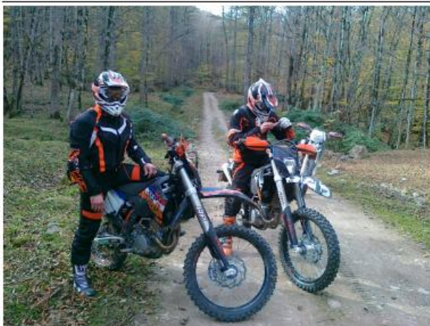
Figure 4. Two Trauma Surgeons Exploring the Wilderness and Woodlands of Kelard Dasht Northern Iran While on Vacation; Trail Riding and Hill Climbing