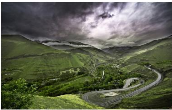
Figure 9. The Spectacular Chalous Road in the Summer ( http://karim-khanzand.com/detail/88 )

most scenic, without a doubt, is the road to the northern city of Chalous known as the Chalous Road. This