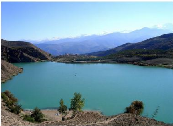
Figure 8. The Splendid Valasht Lake ( http://commons.wikimedia.org/wiki/File:Valasht.jpg )