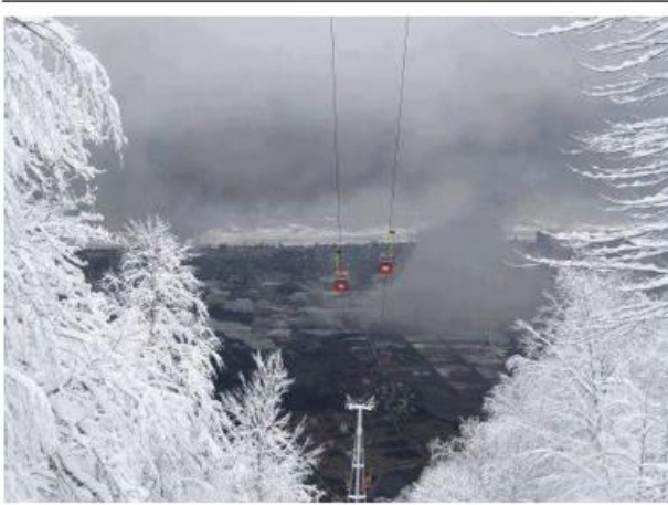
Figure 7. Breath-Taking View of the Namak Abroud Cable Car Ride in the Winter ( http://fbstatus.mihanblog.com/post/599 )