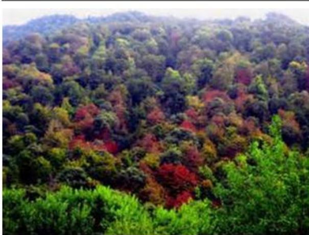
Figure 2. Spectacular Colorful Foliage of Mazandaran Forests in Autumn