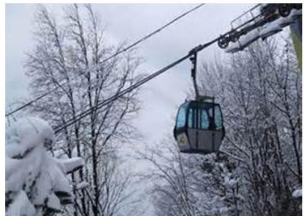
Figure 6. Namak Abroud Cable Car Ride in the Winter