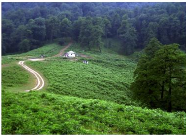
Figure 3. The Mountainous Region of Ramsar with Beautiful Foothills of the Alborz Mountain Range, Covered With Dense Forests and Meadows. The Lush Green Forestry and Calm Are Perfect for Relaxation ( http://www.irantourcenter.com/Mazandaran/default.aspx )