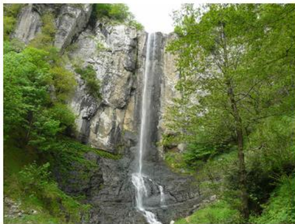
Figure 13. Lawton Falls in Gilan, Iran