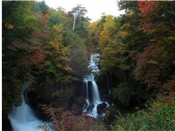
Figure 11. Beautiful Waterfalls Near Chalous City, Iran