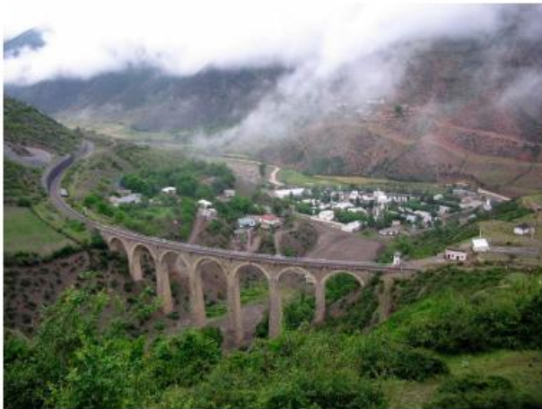
Figure 17. Mazandaran Savad Kooh Bridge