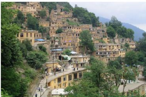
Figure 18. City View of Masuleh