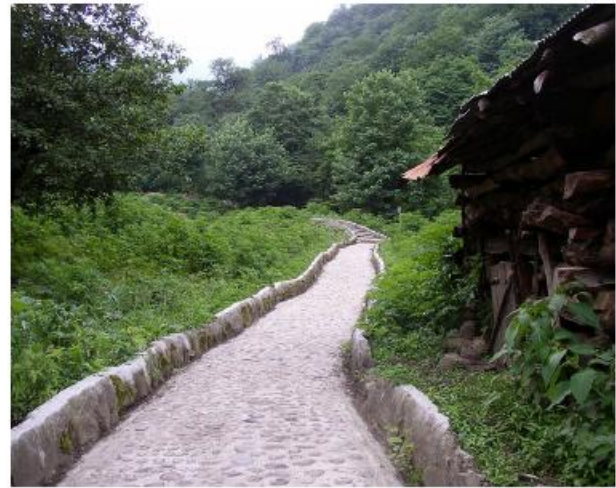
Figure 19. The Parke-Ghale-Rud Khan in Gilan Province of Northern Iran is a must-see site

Rudkhan Castle is a medieval brick and stone structure in Fuman, Iran. The castle is located on a mountain 25 km southwest of Fuman city in the Gilan province of northern Iran. It used to be a military fortress, which had been constructed during the Seljuk Dynasty by followers of the Ismaili sect. The castle covers an area of 2.6 hectares (6.4 acres). Its architects used the natural mountainous features to their benefit in the construction of the fort. The Rudkhan Castle River originates from the surrounding mountainous heights and flows from the south to the north. After crossing a mountainous winding trail in dense forests, the first thing that is noticed about the castle is its entrance gate. Rudkhan Castle sits between two peaks of a mountain at elevations of 715 and 670 m and contains strong fortifications and battlements spanning a length of 1,550 m. The castle's 42 towers still stand intact (Figure 19 - 21).