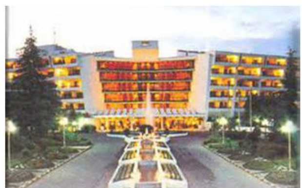
Figure 15. Azadi Hotel at Dusk