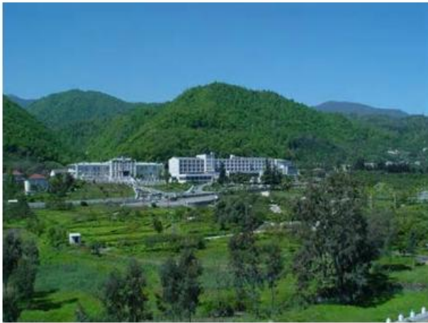
Figure 16. Ramsar Hotel Resort Nestled in the Mazandaran Mountains.