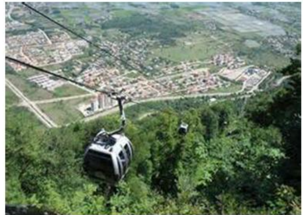
Figure 5. Arial View of Namak Abroud Cable Car Ride in the Summer.