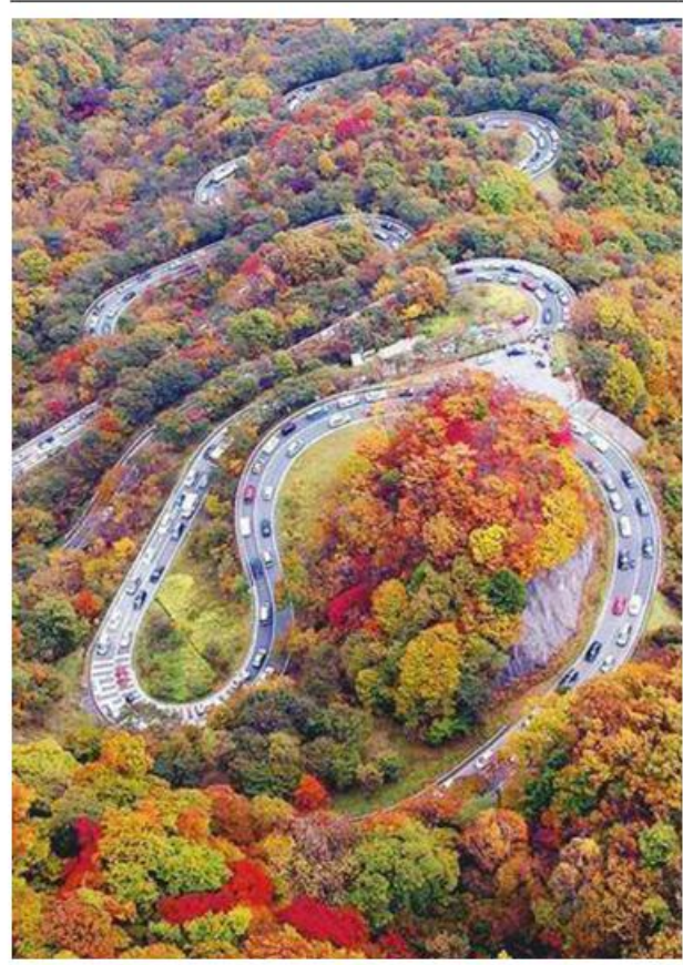
Figure 10. The Magnificently Colorful Chalous Road in Autumn

most scenic, without a doubt, is the road to the northern city of Chalous known as the Chalous Road. This