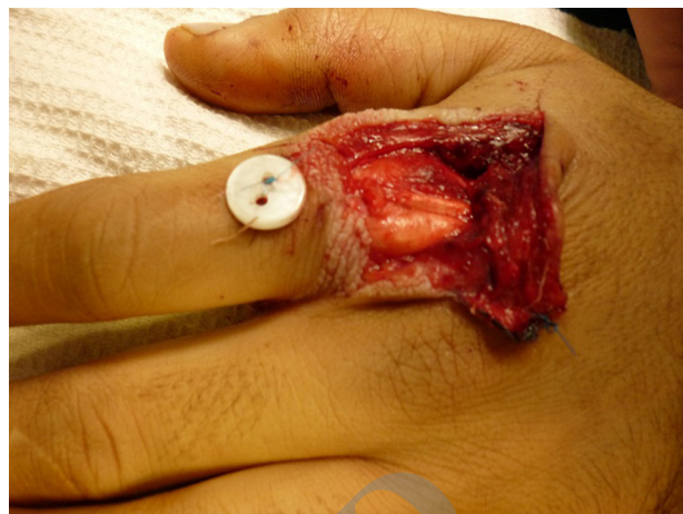
Figure 2. Intraoperative Photography of Roll Stitch Suture