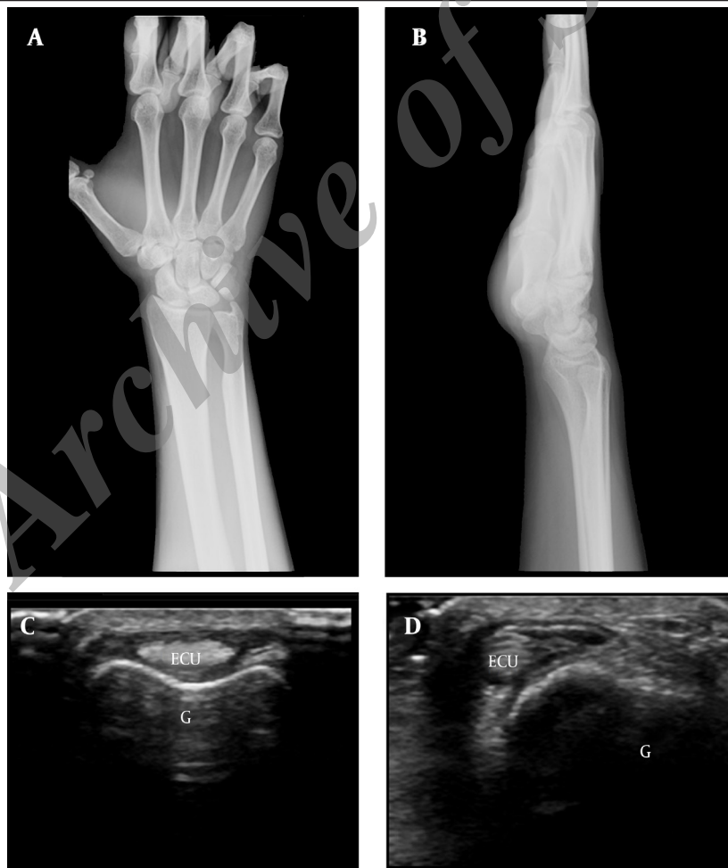
Figure 1. A) Anteroposterior; B) Lateral plain radiograph of the patient's right wrist demonstrating no pathology; C) Transversal U/S scan at the level of ECU tendon's groove with the forearm in pronation. The ECU tendon is lying in its groove (normal position); D) With the forearm in supination the ECU tendon is dislocated volarly, at the ulnar side of its groove.

All procedures concerning the management of the patient were in accordance with the Helsinki Declaration of 1975, as revised in 1983.