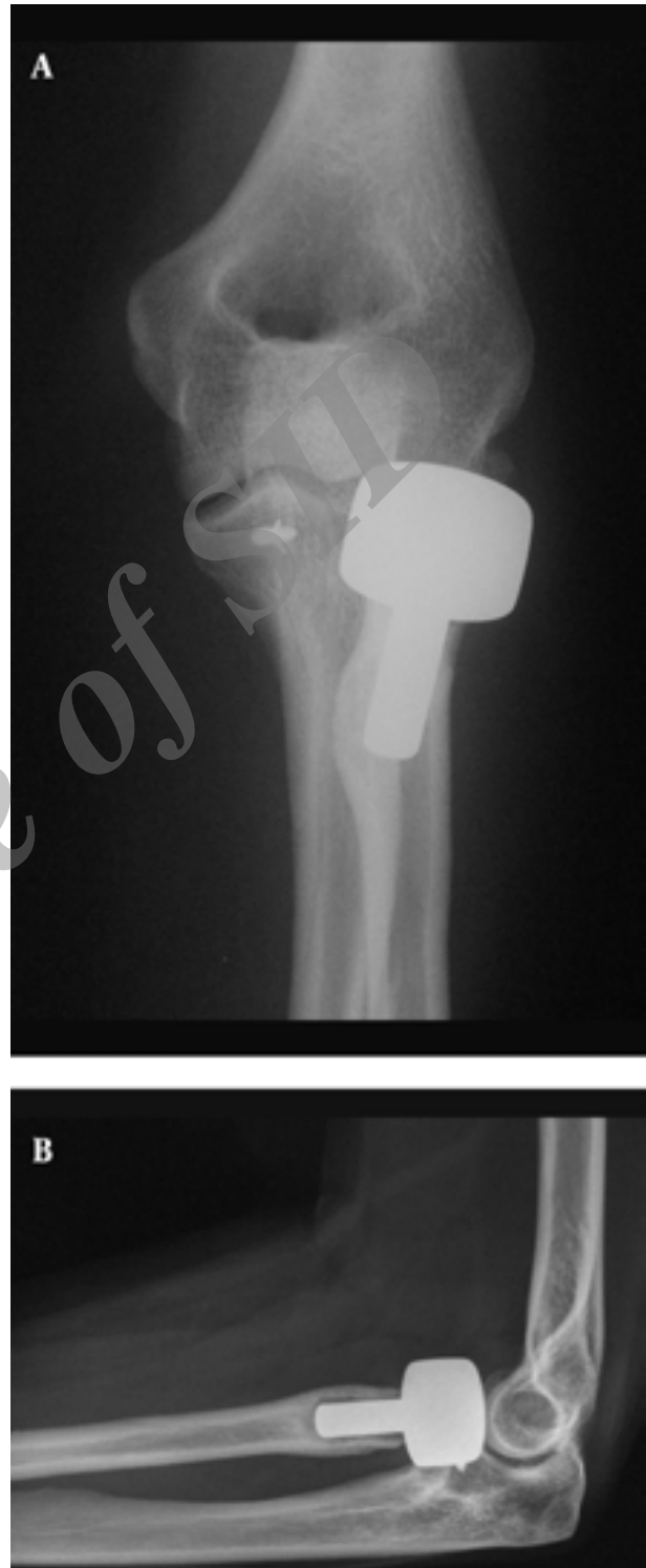
Figure 2. A, Anterior-Posterior (A.P.) Radiograph of the Left Elbow 19 Months After Trauma; B, Lateral Radiograph of the Elbow 19 Months After Trauma With Minor Radiolucency Lines Around the Stem