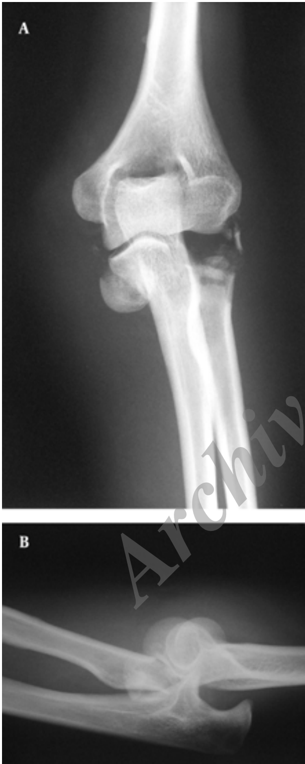
Figure 1. A, Anterior-Posterior (A.p.) Radiograph of the Left Elbow at Trauma Date; B, Lateral Radiograph of the Left Elbow at Trauma Date