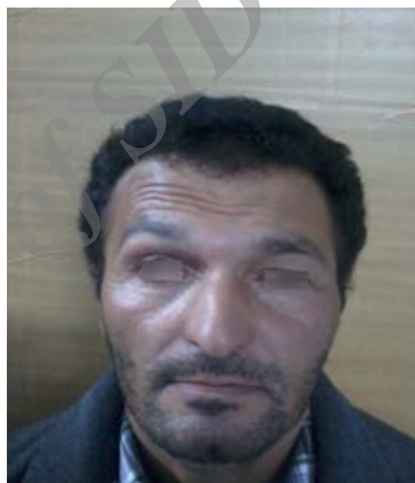
Figure 4. 1.5 years After Surgery

However, damage to the facial nerve branches following laceration is also common.