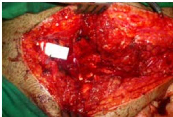
Figure 2. During the Operation