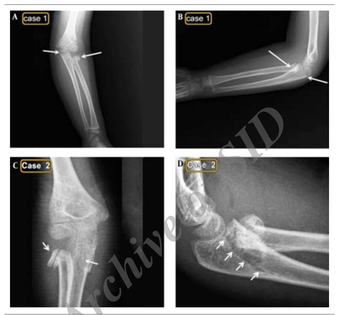
Figure 1. Pre-Operative Radiographic Appearence. Arrows show lateral displacement of radial head and non-displaced fractured olecranon in anteroposterior and lateral view. Notice that proximal radio-ular diastasis did not exist in both cases.

After 2 months of follow-up, patients had no pain in their elbow and full functionality with a full range of motion of the elbow. Posterior interosseous nerve functions were normal.