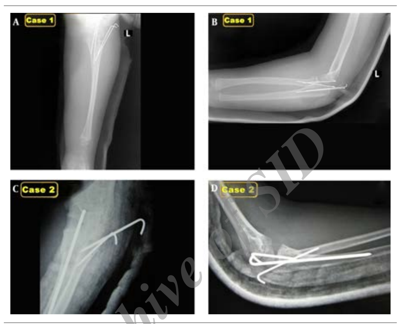
Figure 2. Notice Post-Operative Anatomic Reduction and Fixation With K-Wires in Case 1 and Case 2

sis of fracture characteristics (Box 2) (7-10).