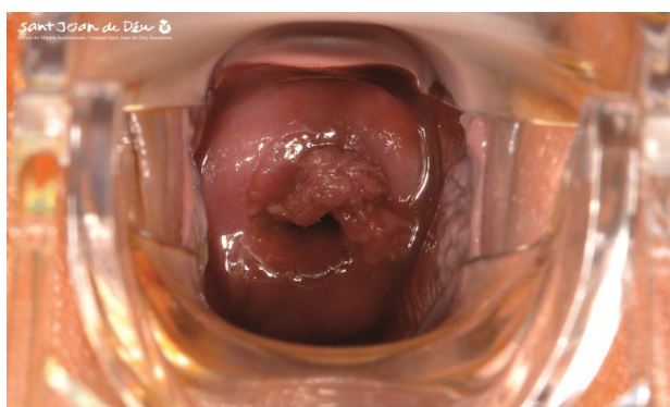
Figure 2. A significant decrease in the lesion was observed. The features of the camera were: Nikon D800E; 60mm Lens; 125 Shutter speed; f-29; ISO 100; Flash ring.