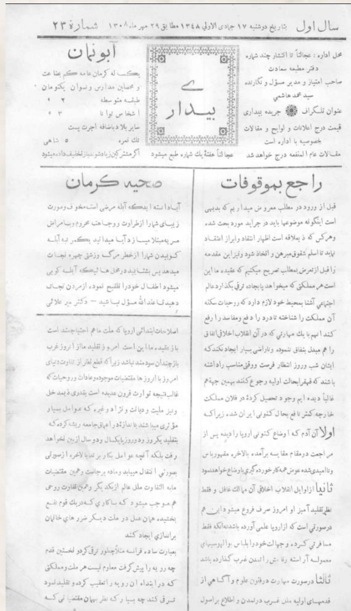
Figure 1. One of the first issues of the Bidari newspaper; on general health and the prevalence of smallpox (The Bidari newspaper, 1929, p. 1)

factors in the failure of treatment and the death of the poor. According to this newspaper, in 1930, many patients died because of the fever widespread in Kerman. In the meantime, criticisms were aimed at the government, asking the members of the government to monitor the drug and its availability more closely (The Bidari newspaper, 1930, 63, p. 2). However, this problem persisted. A year later, the newspaper's writers criticized the government for the shortage of medicine and the problems of the poor, urging the government to assign some pharmacies to provide patients with free-of-charge medicine. They also criticized the fluctuated prices of European medicines