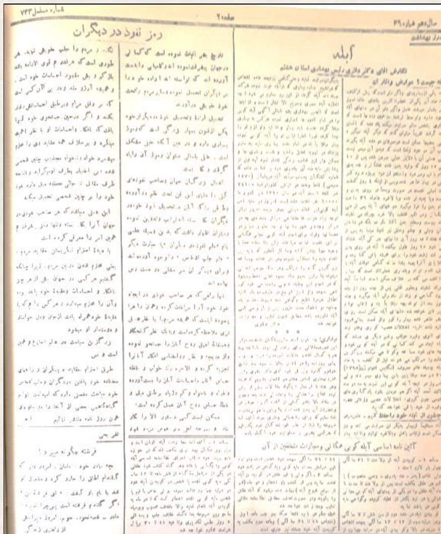
Figure 2. Introduction of smallpox and the need for more attention to treat this disease ( The Bidari newspaper , 1940, 10(39), p. 2).

physician, Zakaria Razi. With the efforts of Amir Kabir, endeavors were made to fundamentally control this disease, and to this end, in 1305 SH, an office for smallpox vaccination started its activities in different parts of Iran for free. People's inattention to this issue made many parents prevent their children from getting smallpox vaccination. A review of the newspaper's articles showed that most medical-related articles were related to smallpox and measles. This issue manifested the severity of this disease in Kerman province even up to the last years of the first Pahlavi era, despite the efforts made to combat this disease. In 1940, Dr. Irani, the head of the health department of the eighth province (Kerman), gave a detailed speech about this disease, its dangers and the way(s) to prevent its spread at Pahlavi High School, and the Bidari newspaper published the full text of the lecture for public awareness. ( The Bidari newspaper , 1940, 9(91), 9 February 1940, p. 1) In 1940, the outbreak of this disease caused the newspaper to write strict instructions to be applied for smallpox ( The Bidari newspaper , 1940, 10(39), p. 4). (Figure 2)