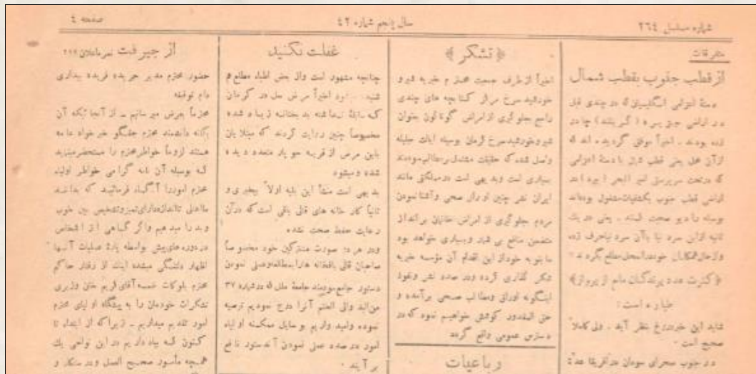
Figure 3. About tuberculosis and the relationship between carpet weaving and tuberculosis (The Bidari newspaper, 1935, p. 4)