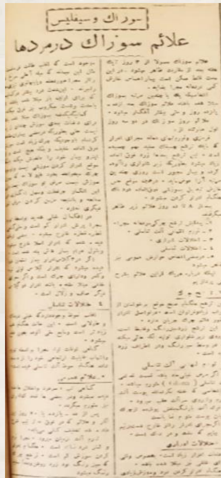
Figure 4. Gonorrhoea and its symptoms in men ( The Bidari newspaper , 1941, 11(12), p. 3)

vices were obliged to treat poor patients for free ( The Bidari newspaper , 1941, 11(7), 14 July 1941, p. 2).