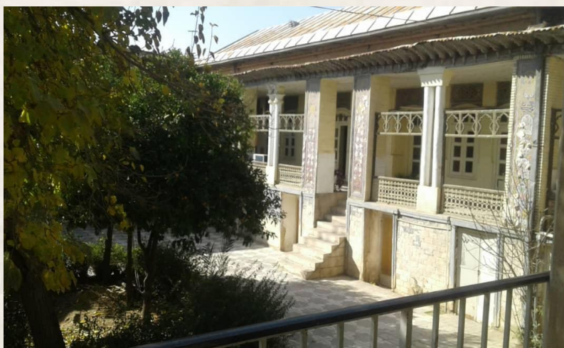
Figure 1. A photo of Namazi Behbudistan in 2020