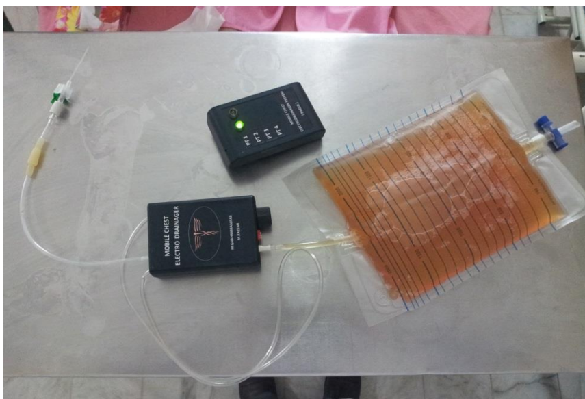
Figure 2: Chest electro-drainage after practical use